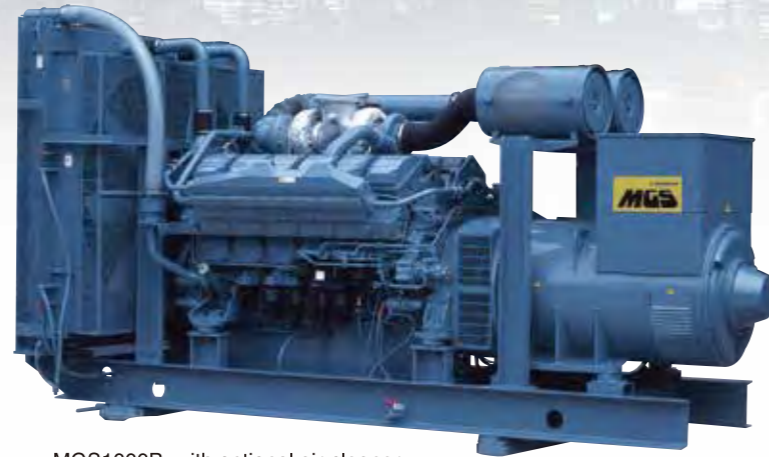
MGS1000B, with optional air-cleaner

Ranging in capacity from 0.5 to 56,400 horsepower, Mitsubishi brand diesel engines offer a series of versatile power generating systems. Mitsubishi Heavy Industries, Ltd. has continually introduced upgraded its engine products since the inception of business in 1917, and now the MITSUBISHI GENERATOR SERIES "MGS" provides a higher generating power rating and more advanced control systems than ever before, with proven reliability based on the continued research and development. The best performance-matched engine system configured with Mitsubishi diesel engines and Mitsubishi turbo-chargers, which are engineered and manufactured in the same facility, is certain to result in the high productivity and improved fuel economy in the MGS Power Generation. Every unit is inspected and tested before leaving the factory and the test report is sent with the genset. MITSUBISHI MGS – All Mitsubishi assembled, tested and supported.