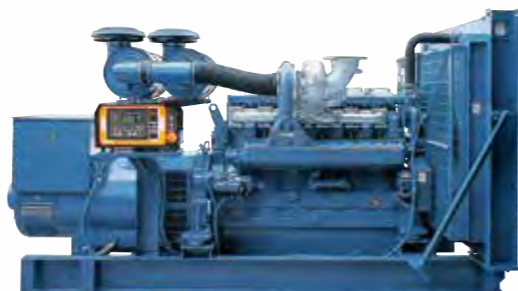
MGS0500B, with optional air cleaner